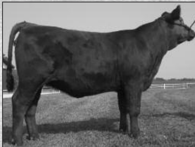
BATTERSON ROSE 269W • Lot 5

Rose is a very powerful made individual that has the brood cow look. She is sired by the now deceased 10,000 PIE Count Down bull. Her dam is a high producing Deep Creek 120 Female with an MPPA of 103.4 and weaned off Batterson Rose 269 at a ratio of 111 in 2009. In the 2004 Iowa Beef Expo a Deep Creek sired bull named Montana Creek bred by Meadow -West Farms sold to James Red Angus and sired numerous champions including the 2009 Iowa State Fair grand champion female and the 2009 Kick Off Classic high selling female at 16,000. 269W is a sure bet to generate dollars each and every year as a brood cow.