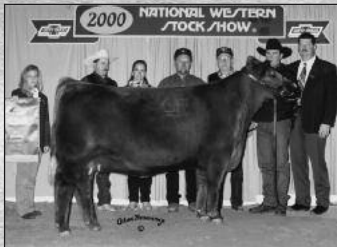
FEDDES BLOCKANNA 807 • MATERNAL GRANDDAM OF LOT 43

Wide Open has been turning heads since the day he was born. His sire comes from Canada and has produced extremely stout calves that are easy keeping. His dam is out of one of our most cherished cow families, Blockanna. The Blockanna cow family is known for having beautiful udders, are extremely eye appealing and very sound structured. Don't miss out on this one. To see more pictures of him visit www.solutiongenetics.com