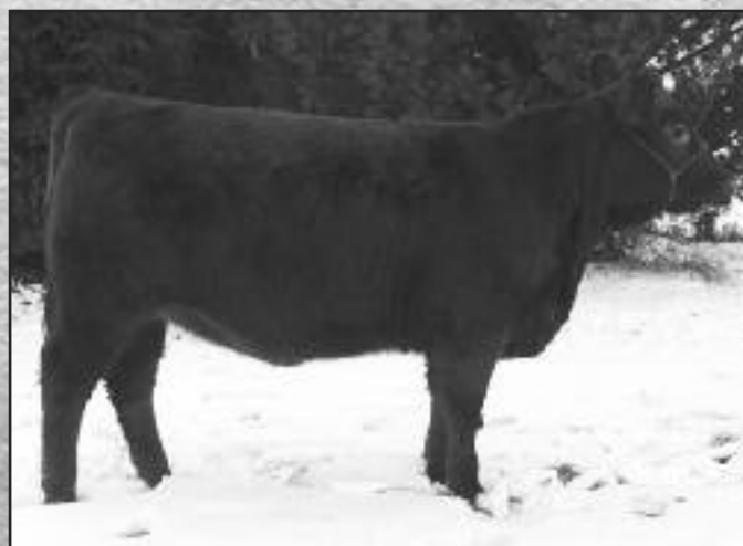
TJC SATURN 914W • Lot 44

This is a tough heifer to part with. She has been a personal favorite of mine and of many visitors we have had at the farm. She is easy to look at while excelling on performance with a weaning ratio of 111. She is like a kitten when it comes to her disposition and would make a great heifer for a junior or anyone looking to bolster their pasture. Don't let this one get away.