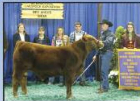
The dam of the 2009 National Reserve Grand Champion Bull was produced in Iowa

Other national winners produced in Iowa include the Bull Calf Champion / dam in the Cow-Calf Pair Grand Champion / Reserve Bull Calf Champion / Intermediate Bull Champion / Reserve Heifer Calf Champion