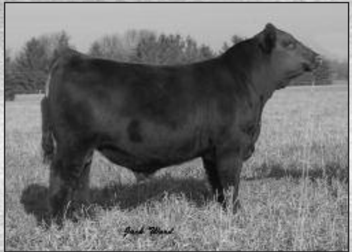
TC 4WA MONTANA CREEK • Lot 9

A big stout son of the now deceased Montana Creek that has been a great breeding bull in a short period of time. His Dam, TC Racheal 17T, was the high selling female in the 2008 sale. Don't miss out on a great breeding sire.