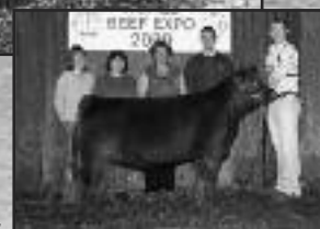
FULL SISTER TO LOT 4