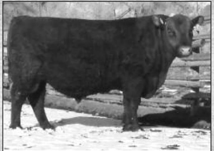
5L SIGNATURE 5615 • SIRE OF LOT 39