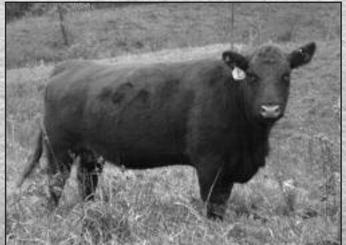
NOLINS MISS LINDSAY • LOT 57

Miss Lindsay is a full sib to No Equal 385. She is extra long bodied. Few red angus have this length of body. She was Division winner at the Iowa State Fair. Miss Lindsay is P.E. April '09-July '09 to Red Hills 17P 101S. Calf due in March.