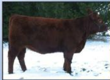
WEBR Doc Holiday X Red Spread 3068. This show heifer / Donor Prospect. Sells at the Iowa Beef Expo II

EPD Averages for Proven and Opportunity Sires in the 2010 Sire Summary: