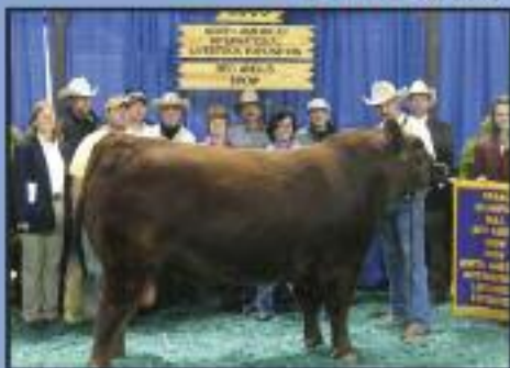
The dam of the 2009 National Grand Champion Bull was produced in Iowa

At the 2009 National Red Angus show in Louisville, Kentucky, Iowa genetics dominated the breeding line-up !