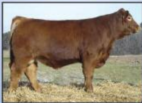
Meado-West Montana Creek X Meado-West Jazz. This national Herd Bull Prospect. Sells at the Iowa Beef Expo II