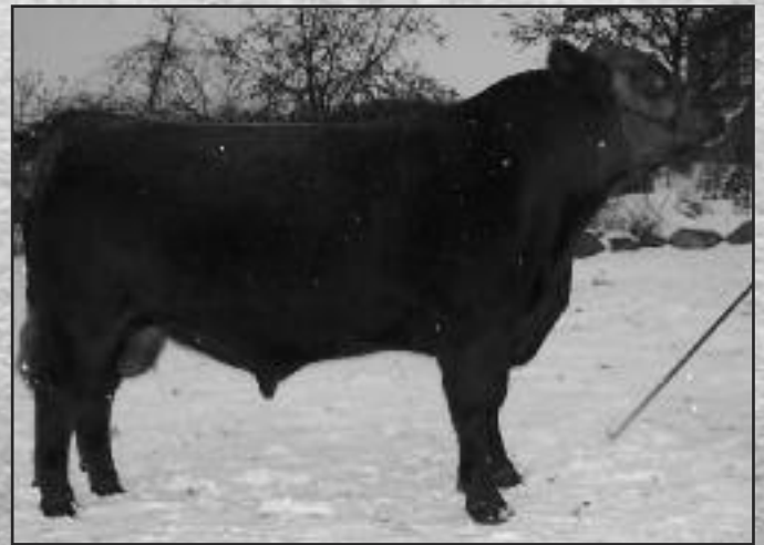
WSF MACK 58M U58 • Lot 50