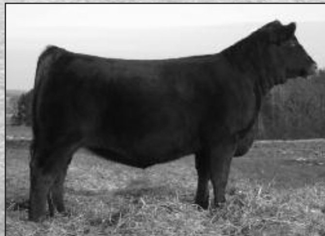
MEADO-WEST WANDA 906W • Lot 72