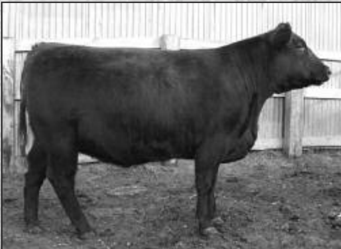
Twilite Utah U843 • Lot 47

Twilite 94 is sired by one of the most widely used bulls in Canada. If you want a female that will have good feet, legs and a great udder, here is your girl. She was raised on native grass pasture with no creep feed.