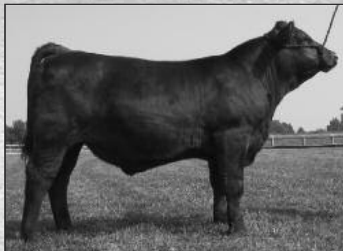
BATTERSON VISTA 418W • LOT 8

Sired by the new Genex Sire Six Mile Sakic that has created a lot of talk in the Red Angus circles. 84W is a stout made, thick-topped, deep sided individual that is packed full of red meat. His dam is a very consistent producing easy keeping female with an MPPA of 102.3 and a maternal sib to the 2004 Nebraska Cattle Men's Classic champion bull that was later named bull calf champion in Houston. This is a unique opportunity to take advantage of the mating of two of the most powerful bulls in the breed and one of the first chances to put a SAKIC sired bull to work in the breeding pasture this spring.