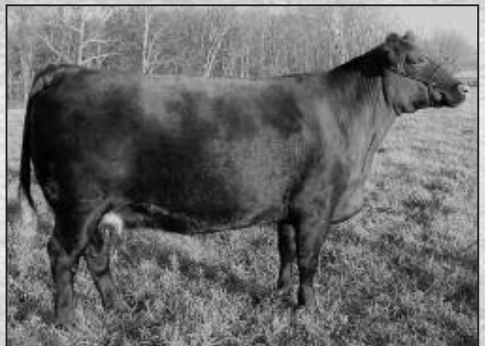
SLGN RILEY 505R • DAM OF LOT 21

This young April female has a very bright future ahead of her. This heifer is really the total package, not only did she post a 108 weaning weight ratio, but her balanced epd profile, fleshing ability, and brood cow look are sure to make her a productive and profitable female in anyone's herd. Her mother has given us 4 heifer calves, and this is the first one we are letting off the farm. Her sire is a son out of Cheyenne that we raised, and he has been our primary herd sire for four years now. His next calf crop will hit the ground in March, and we have never yet pulled a calf out of him. The maternal power behind this female proven, and the calving ease is built in - don't pass by a female with such potential.