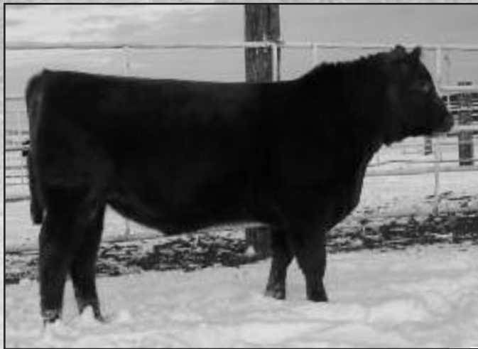
TC HAMLEY 81W • Lot 13