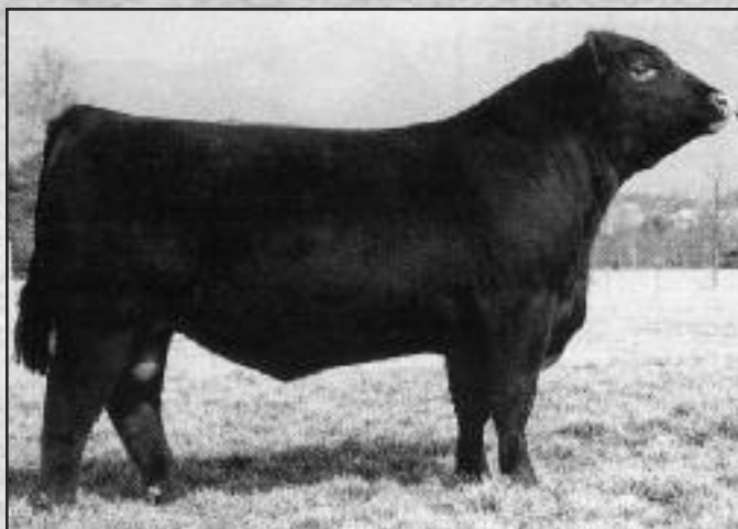
BADLANDS MR BEEF 805 • SIRE OF LOT 24

917W is an attractive heifer that is correct and very feminine. She is a low birth weight female that is long spined with a lot of muscle expression. 917W is a balanced and smooth made heifer that stands very correct on her feet. She should be a very productive female in anyone's herd. Dam post a 102.9 MPPA.