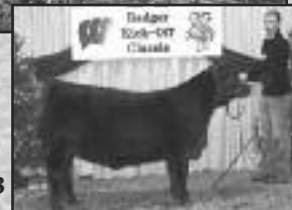
MATERNAL SISTER TO LOT 3