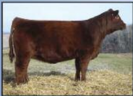
SLGN Regulator X Badlands Mr Beef 805. This show heifer / Donor Prospect. Sells at the Iowa Beef Expo II