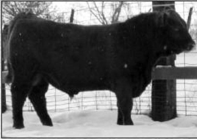
NOLIN'S BOISE 380 • LOT 60