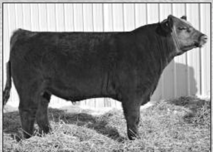
MNS GEORGE 9712 • Lot 67

Son of Major League, out of a first calf heifer. Excellent balanced EPD's. Would make an excellent "heifer" bull, negative on birth. (-.8 BW EPD). Adjusting weaning wt. of 789 lbs and ratio of 108. Dam is a moderate framed female with an excellent udder - sired by LCB Hoss, one of the best maternal sires in the breed. Very long necked yet heavily muscled with large testicles. Grand Dam was division champion at Iowa State Fair and class winner at Denver. Dam was class winner at Iowa State Fair, Denver, and Ft. Worth. Was not shown again due to injury.