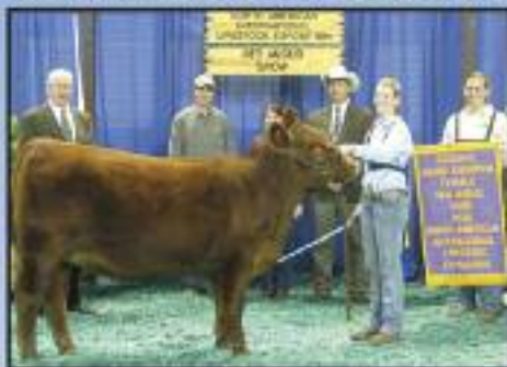
The 2009 National Reserve Grand Champion Female & Junior Grand Champion Female was produced in Iowa