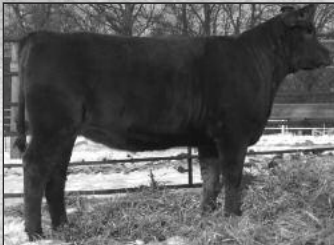
BATTERSON ROSE 90W • LOT 6

Very complete herd bull prospect sired by the 10,500 Midland Bull Test Holden Vista. The Holden Vista X Deep Creek mating has worked very well for the Rock'n R Angus ranch in Kansas in their 2009 sale the top 5 selling bulls were all this very same mating. This mating is a unique combination of extra bone and stoutness with out sacrificing maternal traits with Deep Creek 120 currently @ a 37 on his milk EPD. 418 weaned at just shy of 700 pounds and is currently on target for a yearling weight over 1500 lbs. His dam has a 2 progeny WR @ 106 and produced a member of the 2008 Denver pen for the Rock'n R Angus program while his maternal grand dam has a WR 8 progeny @ 107. He is backed by a great producing cow family, he is big time herd sire prospect and a real herd builder.