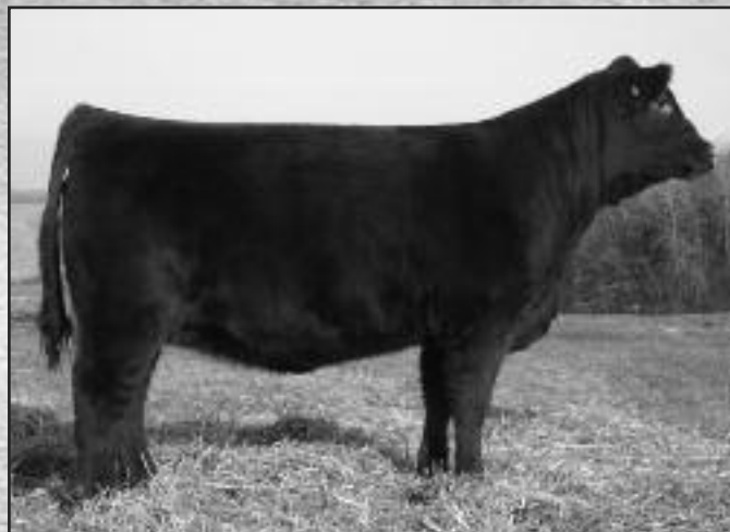
MEADO-WEST 907W • Lot 71