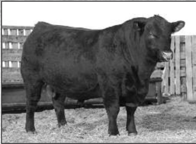
RED LAZY MC HUSTLE 18T • SIRE OF LOT 40