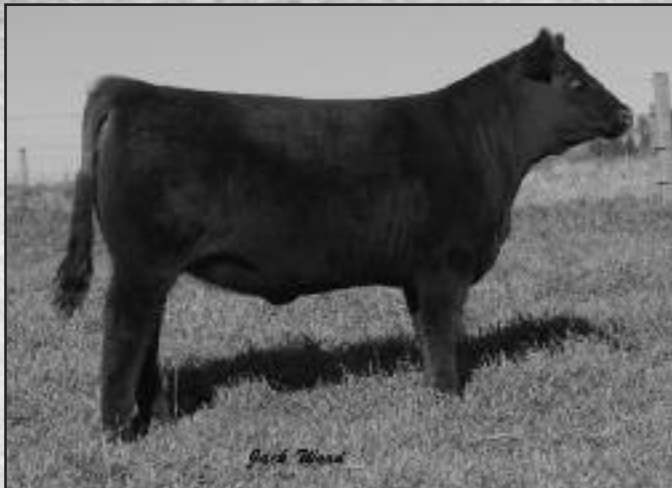
4WA SATIN 93 • LOT 70