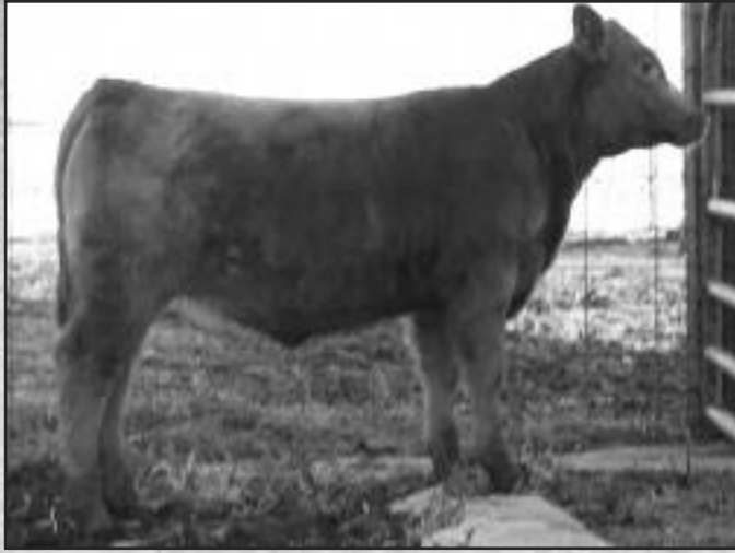
S.C.C. DESTINY S913 • LOT 68