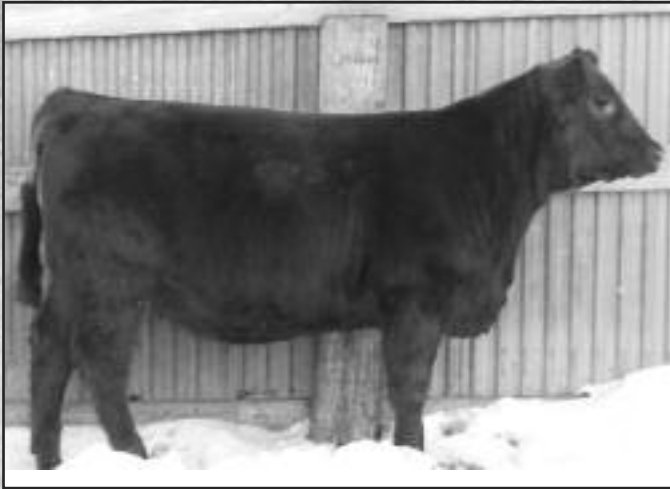
Twilite 94 • Lot 46