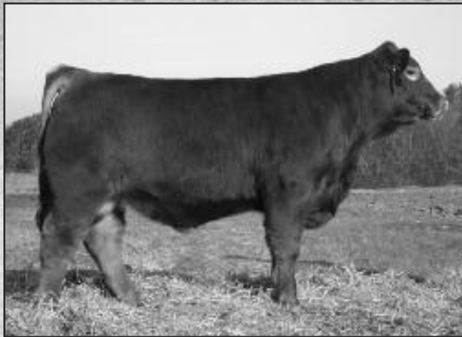
MEADO-WEST WABASHA 914W • Lot 74