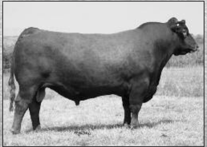
RED FINE LINE MULBERRY 26P • SIRE OF LOTS 33, 35, 37 & 38

Miss Briarberry 924 is the pick of my 2009 heifer calf crop. She is super deep and thick, attractively profiled and can get out and walk. Her mother raised last year's sale lead off and has raised another eye catcher that will make a great herd building female. She was shown this summer and has a great personality.