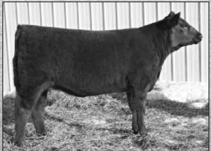
RMS SHANIA 9714 • Lot 66