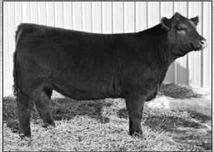
RMS SHAKIRA 9707 • Lot 65

Daughter of Major League. Very eye appealing heifer with a long neck, straight top and level rump. Very deep ribbed and walks out with a long stride. Will be an excellent show prospect. Excellent balanced EPD's. Out of a first calf heifer. Dam is sired by LCB Hoss and is one of our very best young cows. Grand Dam was a Division winner at the Iowa State fair and class winner at Denver. We would be keeping her, except we have retained three bulls out of the same cow family.