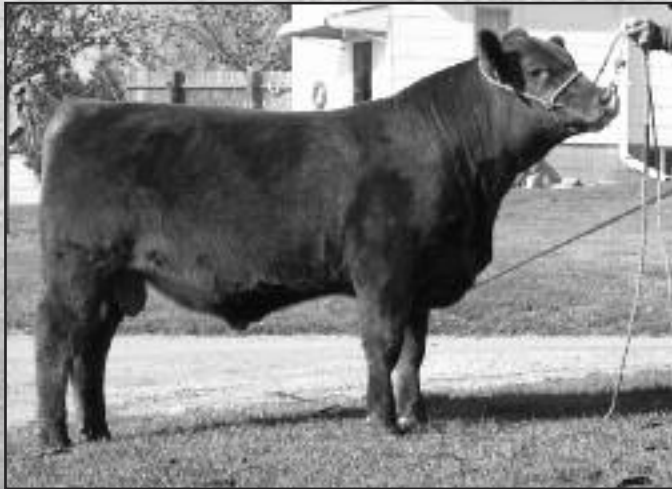
S.C.C. JOE S97 • LOT 69

A tremendously muscular daughter of ABS's GMRA Laramie 5110 that has very balanced EPDs. Her mother is one of our best cows and she also has that great potential. CHV