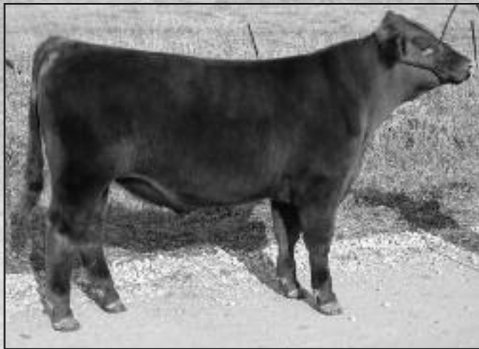
CTRH DOCTOR PERSUASION 102V • Lot 22