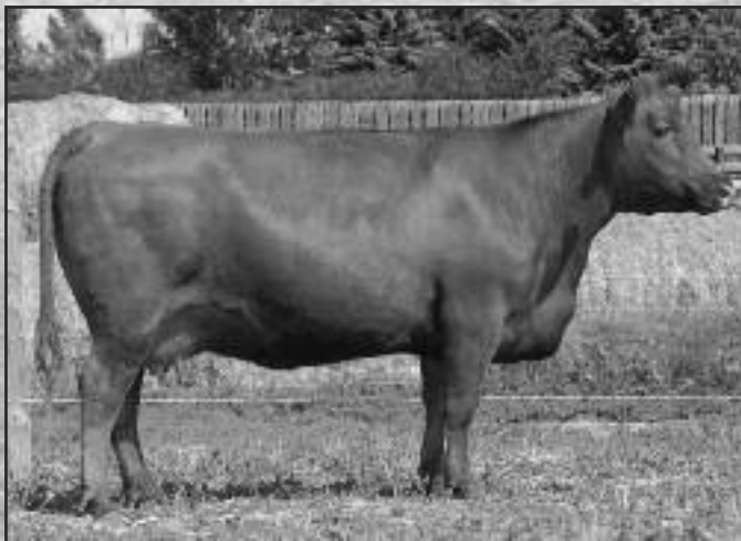
RED LAZY MC HOLLY 37N • DAM OF LOT 41

Here is an outcross pedigree that should get the heads turning in Des Moines. Coming from the well known Lazy MC Angus herd in Alberta, Canada this female offers nothing but positives from a breeders standpoint. She is a very feminine female that offers plenty of depth of body and eye appeal while standing on a very sound foundation. Her dam is a first calf heifer and has a very promising future for Lazy MC. Be sure to view more pictures of her at www.solutiongenetics.com .