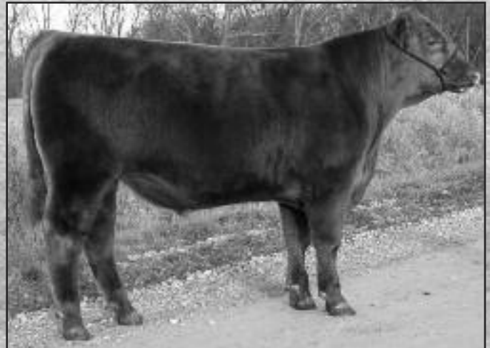
CTRH POWER 2 PERSUADE 103V • Lot 23

Power 2 Persuade is the more performance oriented bull of the pair, posting an individual weaning weight of 729 lbs, having said that, he still has the power and thickness found in his brother. He certainly takes after his dam in the fact that he is really easy fleshing and low maintenance. We have had long family conversations about which one of these two bulls is better, and we still haven't decided. We will let you decide which bull is better for your program, but there is one thing we do know; they are both going to be very productive. At the Iowa State Fair this year, as calves, they took home the honors of Champion and Reserve Champion Bred and Owned Bull. Their Carcass traits should be tremendous, their epd profile is amazing (they rank in the top 22% for BW while maintaining a top 7% rank for YW and a top 14% rank for WW), they are pleasing to the eye, and their pedigree is proven. What more can you ask for? OS tested free pedigree.