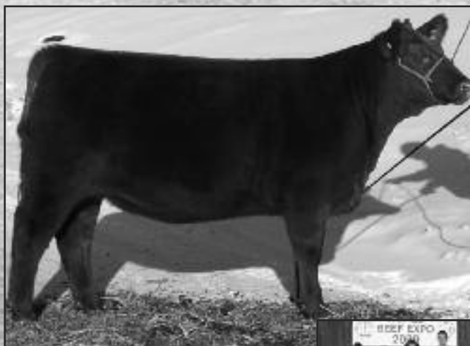
FSR N. KING ESTHER-ET 907W • Lot 4

Here's one to look up sale day. A flushmate to the 2009 World Beef Expo Reserve Calf Champion female. Another flushmate was recently crowned Reserve Champion Red Angus heifer at the Badger Kick-Off Classic. With the extra stoutness of Regulator and the maternal strength of Norseman King, Esther is sure to please in the show ring or the pasture.