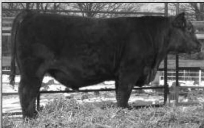
BATTERSON SAKIC 84W • LOT 7

This flawless design Sakic female will most certainly grab your attention at the Expo. She is very attractive in her profile and stands correct on a sound set of feet and legs. Sakic is backed by a very powerful flawless designed dam and 90W will make an excellent addition to any herd.