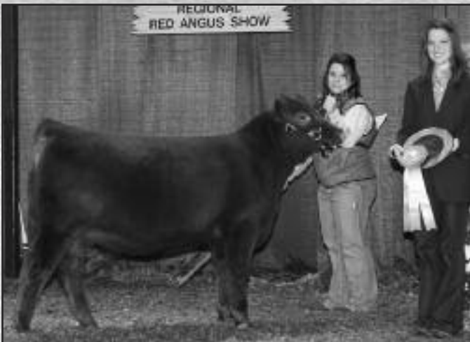
Paternal Sister to Lot 48

Twilite Utah U843's sire Glacier Chateau needs no introduction in Red Angus circles. Her half-sister sold for $5100 at the NILE sale in Billings, Montana recently. She is AI bred to Red Cowfoot Ole's Oscar and pasture exposed to LFRA L329 Target. Due date is March 5th for AI service.