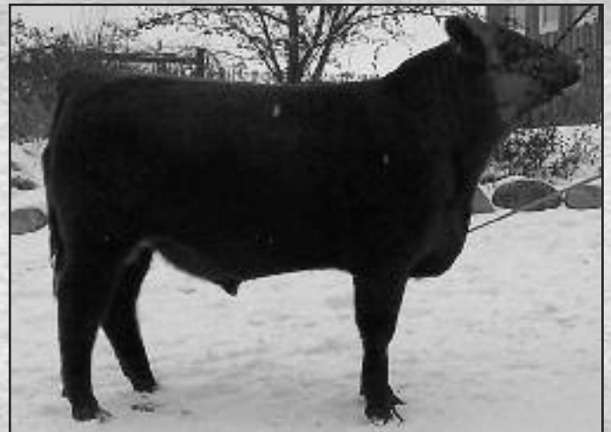
WSF MI KARMA 205T 39W • Lot 51

Here is a bull that sits squarely in the top 25% of his age group in the breed for growth and maternal EPDs. His dam is the $6000 half interest bred heifer that went to Graham Red Angus in our 2008 production sale. 1/3 Interest in his sire sold to Damar Farms in the 2009 Mile High Red Angus sale at the NWSS in Denver for $6500. He is deep sided, super thick and stands on a great foot.