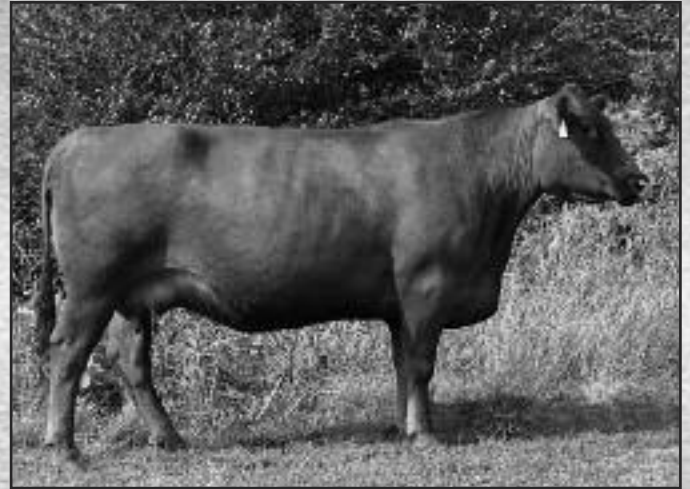
WSF Ms MARY TRN 174 • DAM OF LOT 49