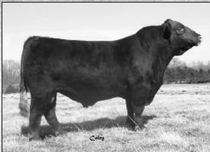
COLEY'S MOJITO 503R • SIRE OF LOT 16

Coffman Red Angus, the breeder of the Dam of the 2009 National Red Angus Grand Champion Bull at the NAILE is pleased to bring a very feminine, dark red, easy keeping heifer to the 2010 Iowa Beef Expo. She is loaded with calving ease with a CED of 10, BW -2.1, and CEM of 11. This cow family is very productive with both grandmothers still producing at 12-13 years of age. She is AI bred to Feddes Big Sky who is the Genex top selling calving ease sire that will add volume and capacity. AI bred 5/20/09 to Feddes Big Sky then PE 5/30/09 - 7/9/09 to LSF RR Picasso.