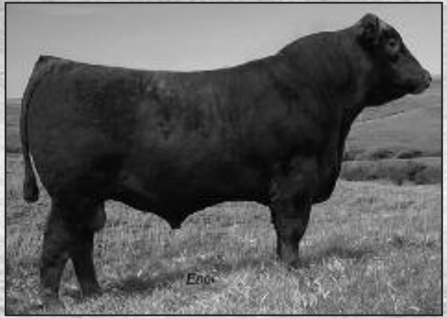
MNA LANCER 6380 • SIRE OF LOT 25