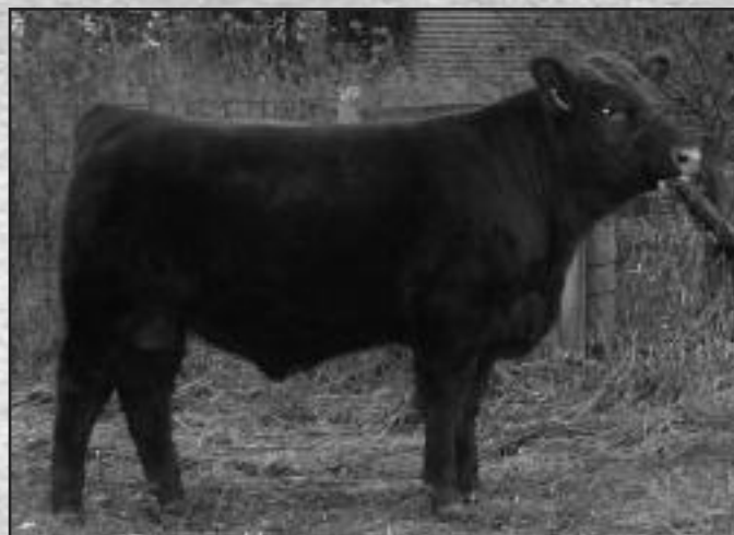
TJC DOUBLE VISION 922W • Lot 45

Here is a Super Vision son that is sure to please. He is a very complete bull with tremendous power and rib shape. He is easy moving in a moderate frame. He comes from one of my personal favorite cow lines. His maternal granddam has recently been moved into our donor pen and we have high expectations for this bloodline moving forward.