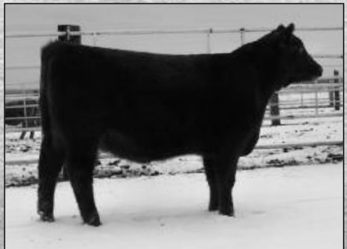
TC ROSA 06W • Lot 10