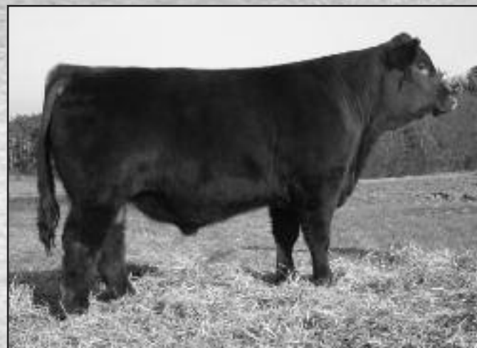
MEADO-WEST WATCHMAN 912W • Lot 73