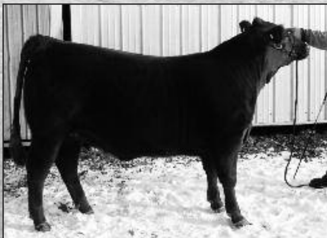
FHR Miss HIGHLIGHT 034 W923 • Lot 1

We will engrave your custom rock from your farm with your house number, cattle company name, etc. Winner to bring rock to Newton, IA for drop off and pick-up. Number of characters depends on size and flatness of rock. Please contact Wyatt Barnett, 515-291-4546, to discuss and make arrangements.