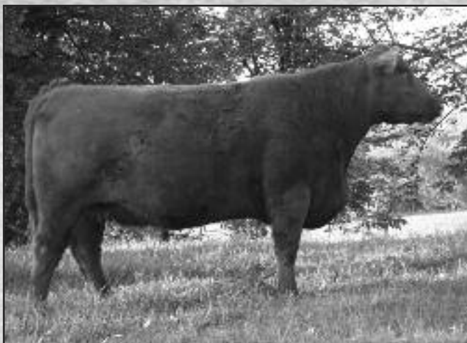
MEADO-WEST STELLA • DAM OF LOT 56

Lot 54 comes to us with a star studded pedigree, a moderate birth weight and a solid 627 lb. weaning weight. Her sire, Nut N Butt Red, was the top selling bull in the National Spotlight Auction in Louisville, Kentucky (NAILE) a few years back. Her dam is an exciting Cheyenne daughter from the famed Crystal cow family at Ludvigsons.