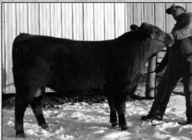
NA HIGH LIFE B33 W962 • Lot 2

Miss Highlight is a dark, cherry red show heifer prospect that is sure to be a highlight in your herd when her show career is over. Her depth of body, spring of rib and structural correctness, combined with her sweet disposition, makes her ideal for any junior member looking to catch the judge's eye next summer.