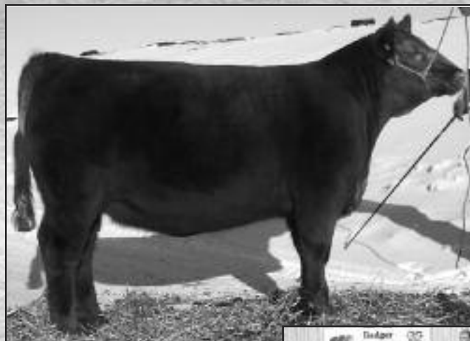
FSR N. KING NATASHA-ET 911W Lot 3

A maternal sister to the recent Badger Kick-Off Classic Champion Red Angus female. Natasha possesses the shape & dimension demanded by progressive Red Angus breeders looking to add power and style to their herd. Her maternal granddam is a full sib to SLGN Regulator. I feel these two consignments are of the highest quality not only phenotypically but they also have the pedigree to back it up.