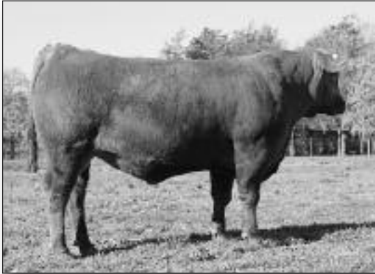
FM Goodnight 1001 • Lot 1