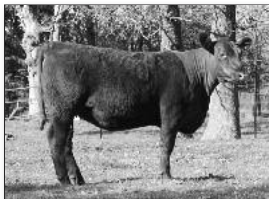
DJH Lucy Jo X46 • Lot 76