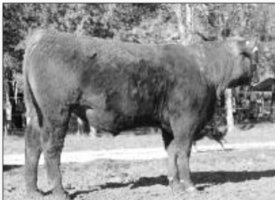
KS 1168 • Lot 33