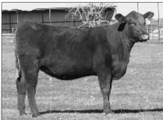
DJH Vicky Jo X35 • Lot 71

Consigned by: Rafter RL Ranch Gainesville, TX 940-736-9953