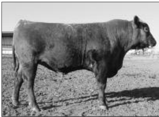
NCTC Show Boy 934X • Lot 48