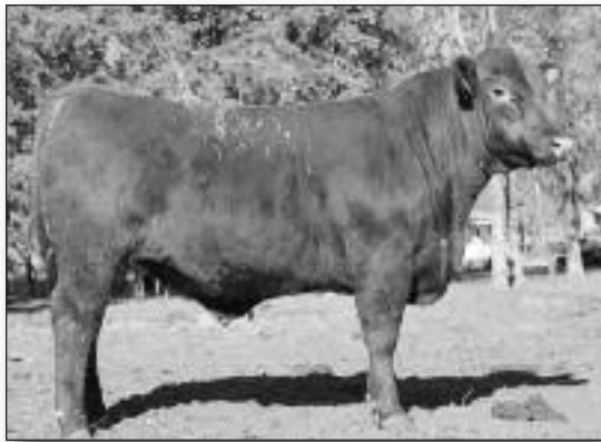
KS 1162 • Lot 4