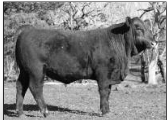
DJH Express Mail 20Y • Lot 41