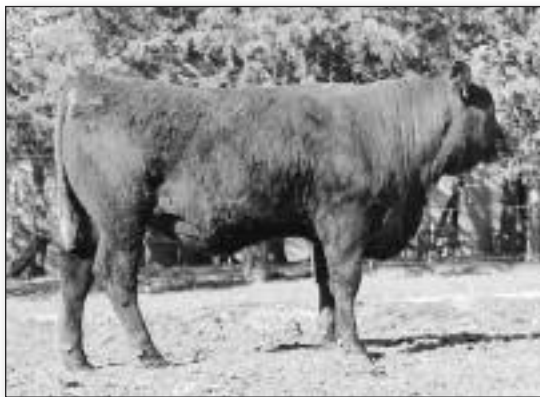
NCTC 004Y • Lot 28