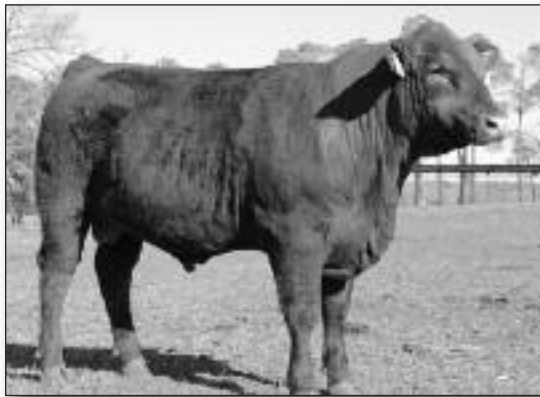
KS 1161 • Lot 16