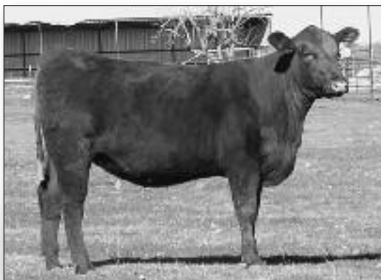
DJH Vicky Jo X35 • Lot 71