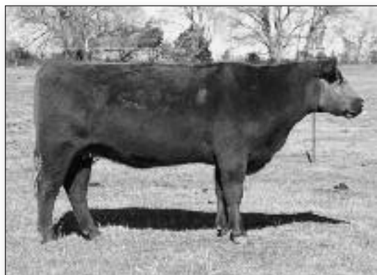
3J Ms Myrrh U107 • Lot 81