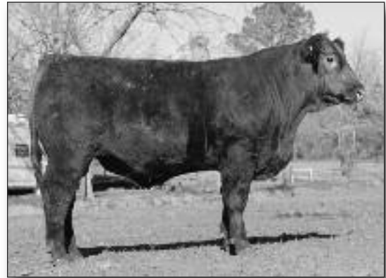
NCTC 005Y • Lot 2

Consigned by: Flying M Ranch Whitewright, TX 903-819-6744