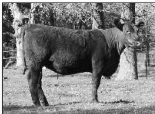
DJH Lucy Jo X46 • Lot 76