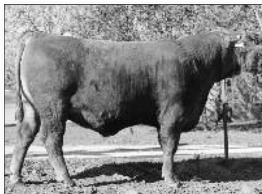
NCTC 001P • Lot 15

Consigned by: Rocking R Ranch Douds, IA 319-310-4289