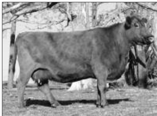
Cashs Nacho 382 • Lot 84

Consigned by: Flying M Ranch Whitewright, TX 903-819-6744