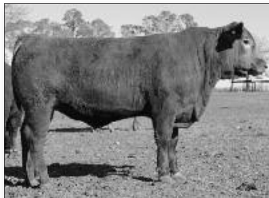
KS 1180 • Lot 26