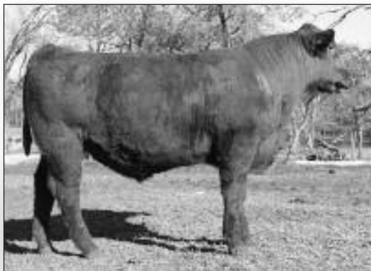
DJH Andre 17Y • Lot 18