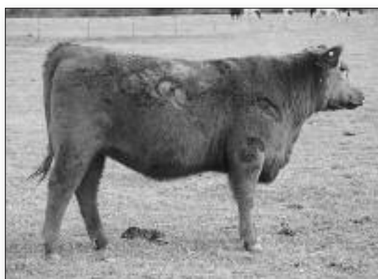
FM Larkaba 1190 • Lot 65

Consigned by: Flying M Ranch Whitewright, TX 903-819-6744