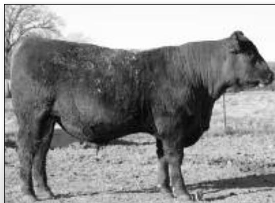
DJH Mojo Rojo 42X • Lot 45