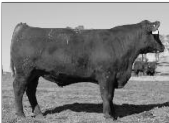
KS 1182 • Lot 37