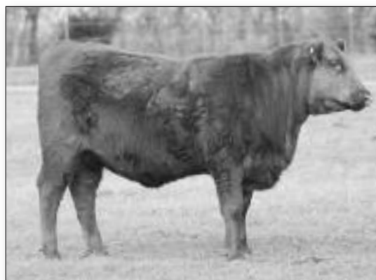
FM Queen Jewel 1029 • Lot 66