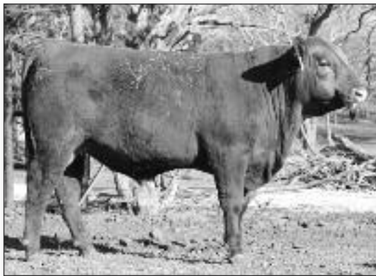
KS 1173 • Lot 19