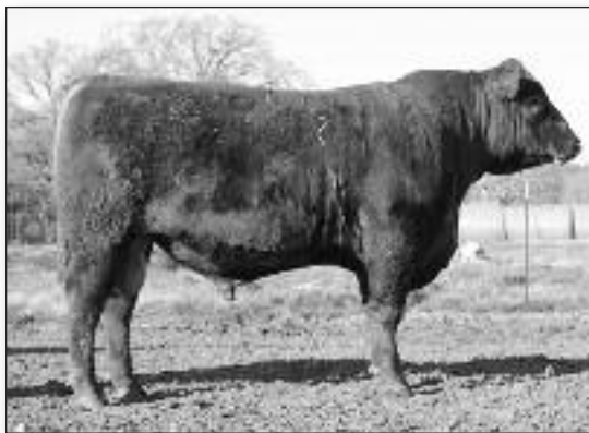
DJH Macs Mogo 40X • Lot 44