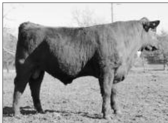
SAR Patron 113Y • Lot 14

Consigned by: North Central Texas College Gainesville, TX 940-736-9953