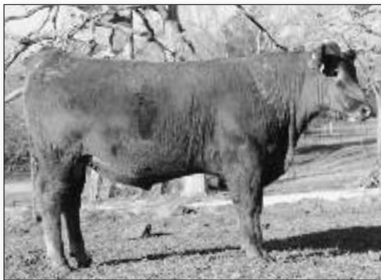
SAR Templeton Rye 103Y • Lot 40