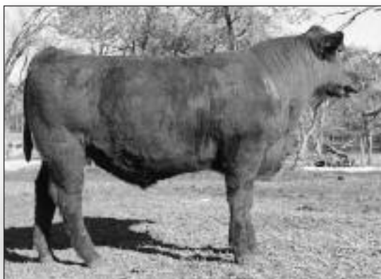
DJH Andre 17Y • Lot 18