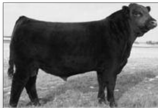
Red DMM Brylor Thump 2T • Sire of Lot 80

Consigned by: Flying M Ranch Whitewright, TX 903-819-6744