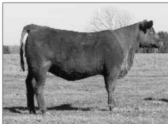
DJH Reba Jo X41 • Lot 70

Consigned by: Rafter RL Ranch Gainesville, TX 940-736-9953