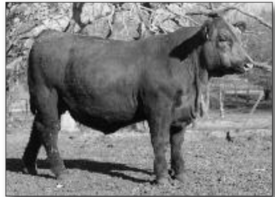
FM Diesel 1108 • Lot 6

Consigned by: Kolle Red Angus- Jim Kolle 361-782-2510