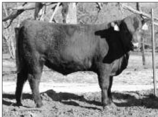
NCTC 003Y • Lot 22

Consigned by: Flying M Ranch Whitewright, TX 903-819-6744