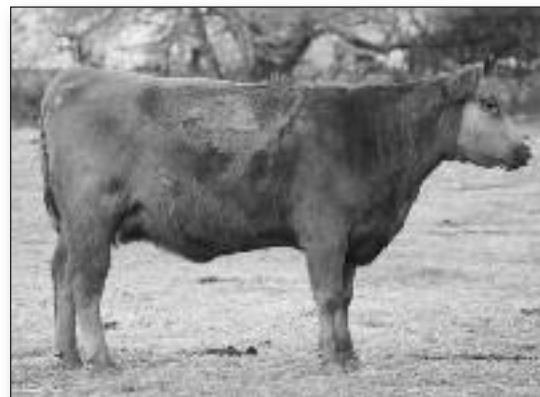
FM Larkaba 1090 • Lot 80

Consigned by: Long Creek Ranch Chikota, OK 214-906-4092