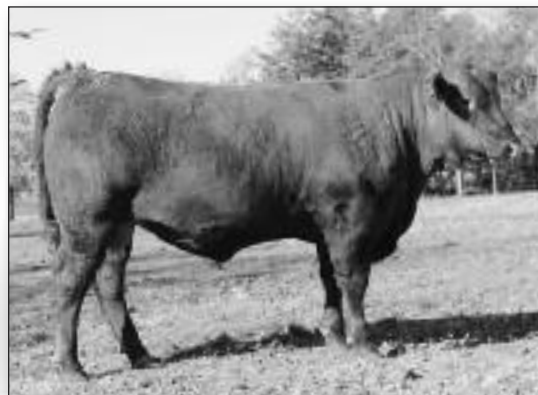
T5 A New Revelation 111 • Lot 9

Consigned by: Flying M Ranch Whitewright, TX 903-819-6744