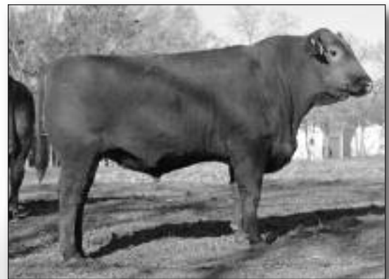
KS 1186 • Lot 5

Consigned by: Flying M Ranch Whitewright, TX 903-819-6744