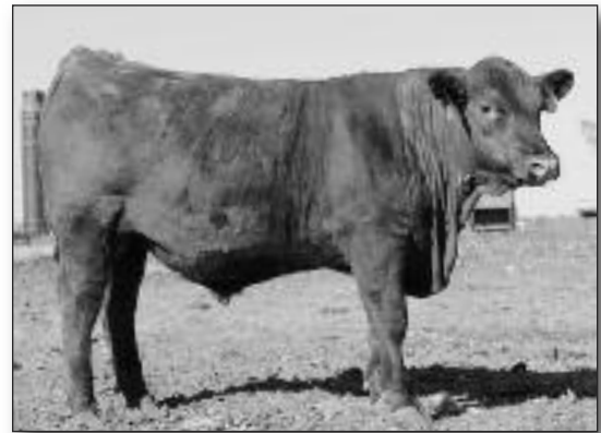
SAR Cerveza 105Y • Lot 17

Consigned by: Kolle Red Angus- Jim Kolle 361-782-2510