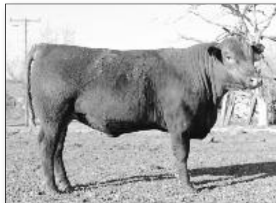
KS 1169 • Lot 31

Consigned by: Rocking R Ranch Douds, IA 319-310-4289