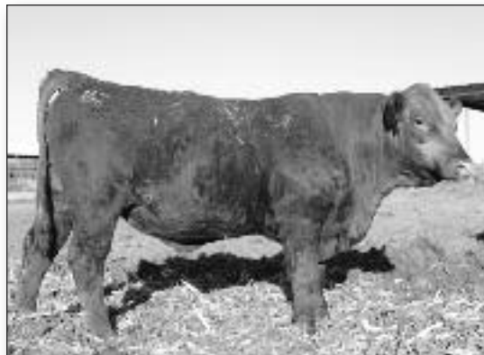
MGB Red Time X20 • Lot 51

North Central Texas College Gainesville, TX 940-736-9953