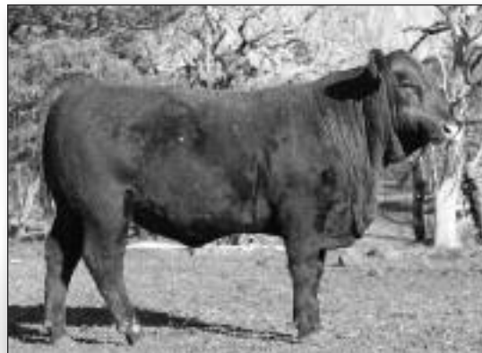
DJH Express Mail 20Y • Lot 41