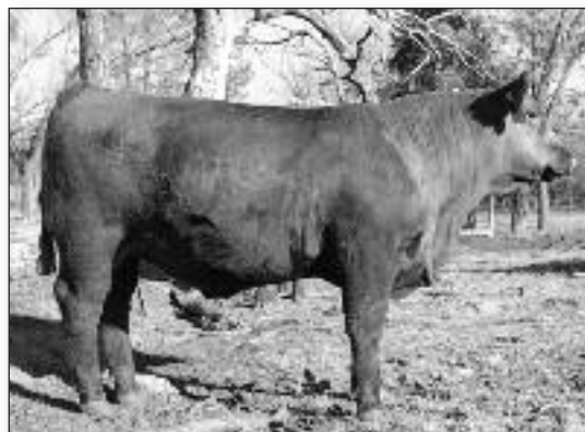
DJH Bevis 06 • Lot 39

Consigned by: North Central Texas College Gainesville, TX 940-736-9953