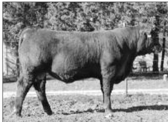
SAR Johnnie Walker Red 112Y • Lot 35